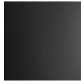
OP69 graphite mat