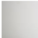
OP71 blanc mat