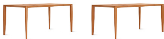
Dante 150 FG 366.00