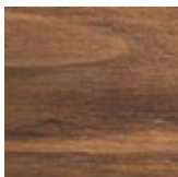
NC noyer canaletto